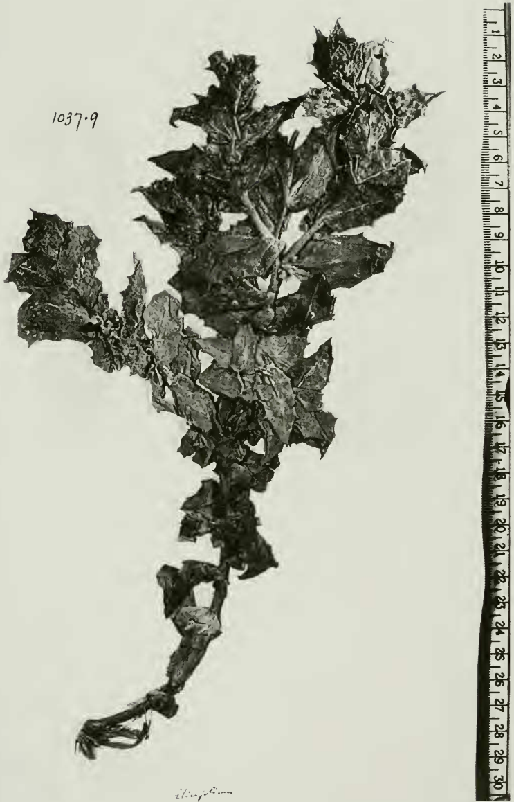
Fig. 1. Lectotype of Osteospermum ilicifolium L., generic type of Nephrotheca B. NORD. & KÄLLERSJÖ. LINN 1037:9 (LINN). "ilicifolium" in LINNAEUS' handwriting.